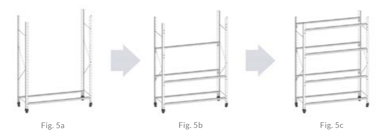
Step 5 | Continue fitting rails, working up from the bottom. Note: it is important to always work up from the bottom. (Fig. 5a-5c)