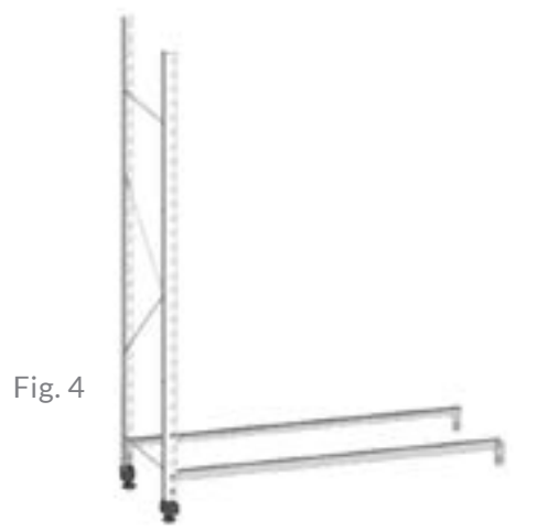
Step 4 | Stand the second matching end frame in position and clip rail connector into the rear post in the identical matching position as the other frame. The two frames will now stand self-supported. (Fig. 4)