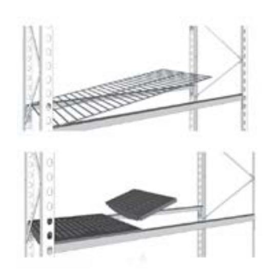
Step 6 | Once all the rails are fitted then place the shelf panels on the rails, whether it be Novex panels, wire racks or metal panel shelves. (Fig 6)