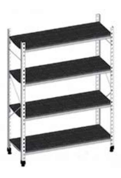
Step 7 | Once assembly is completed position the module in it desired location, check it is plumb, adjust feet if necessary to level the unit. If needed final levelling through adjustable feet can be done in this step as in Step 1.