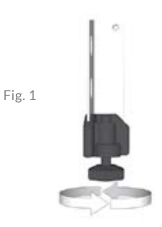
Step 1 \mid Start with end frames, make sure feet are adjusted evenly, lean one frame against a wall or hold in the vertical position with feet on the floor. (Fig. 1)

Step by step instructions for the Z series racking systems.