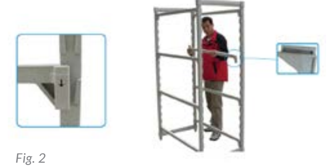
ep 2 | Centre the bott

Step 2 | Centre the bottom of the traverse dovetails with the dovetails on the posts, according to the length of traverses. Slide smoothly into position. (Fig. 2). Please align as shown in this photo above, then let the traverse slide to dovetail.