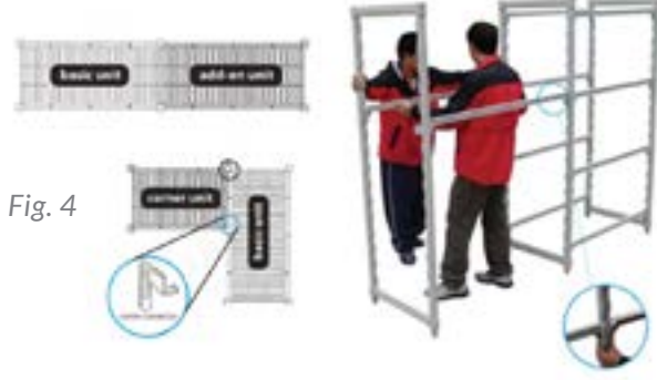
Step 4 | Add an additional unit by connecting two more posts with post connectors and then setting traverses onto the dovetails on the posts. The traverses on the first and second unit share the middle post. Place shelf plates on traverses to complete the second unit. Add an additional unit in a 90° corner using corner connectors. (Fig. 4)

P: 0508 668 256 E: SALES@NOVALOK.CO.NZ W: WWW.NOVALOK.CO.NZ